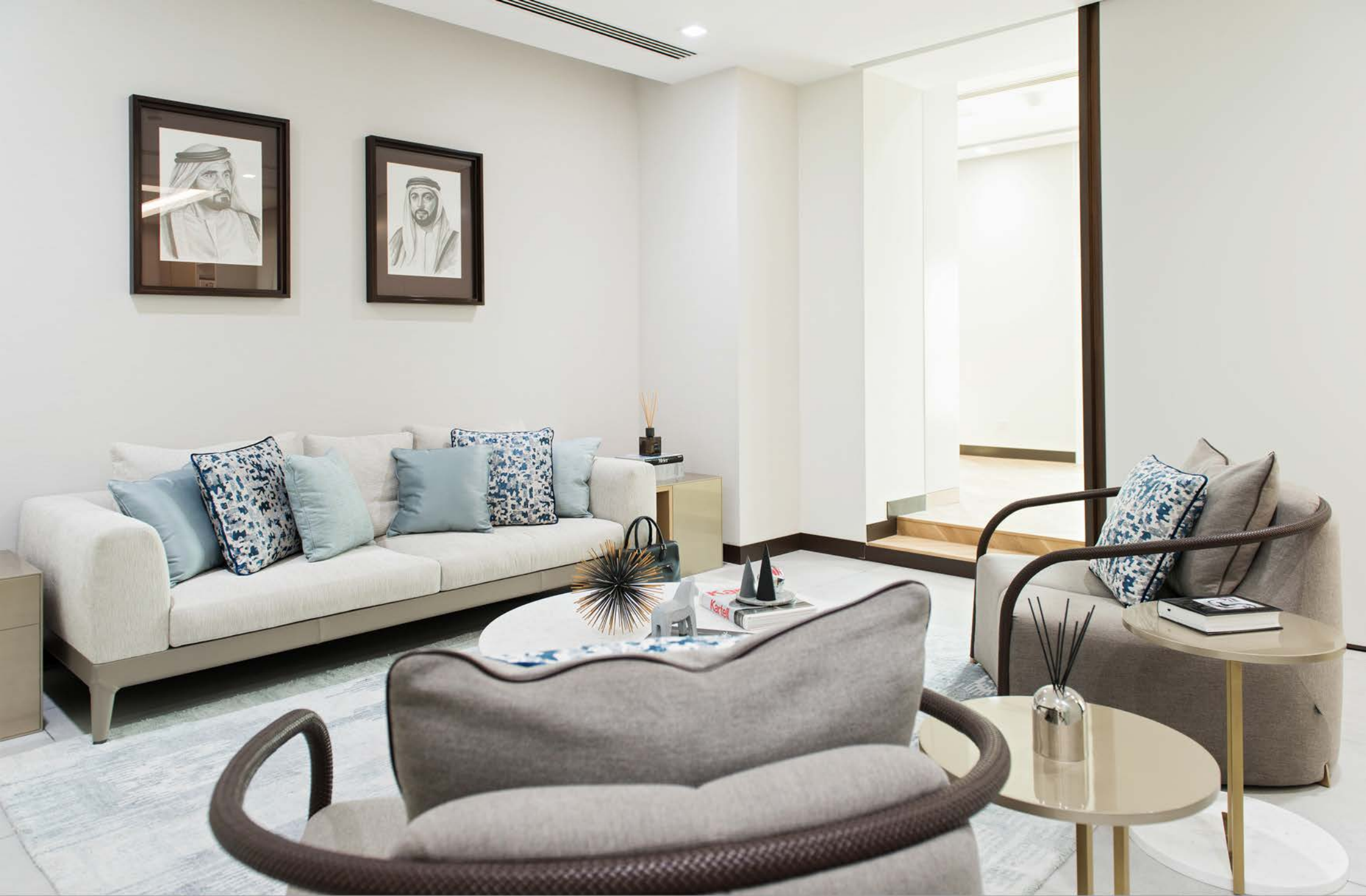
DUBAI HOLDING CHAIRMAN'S OFFICE