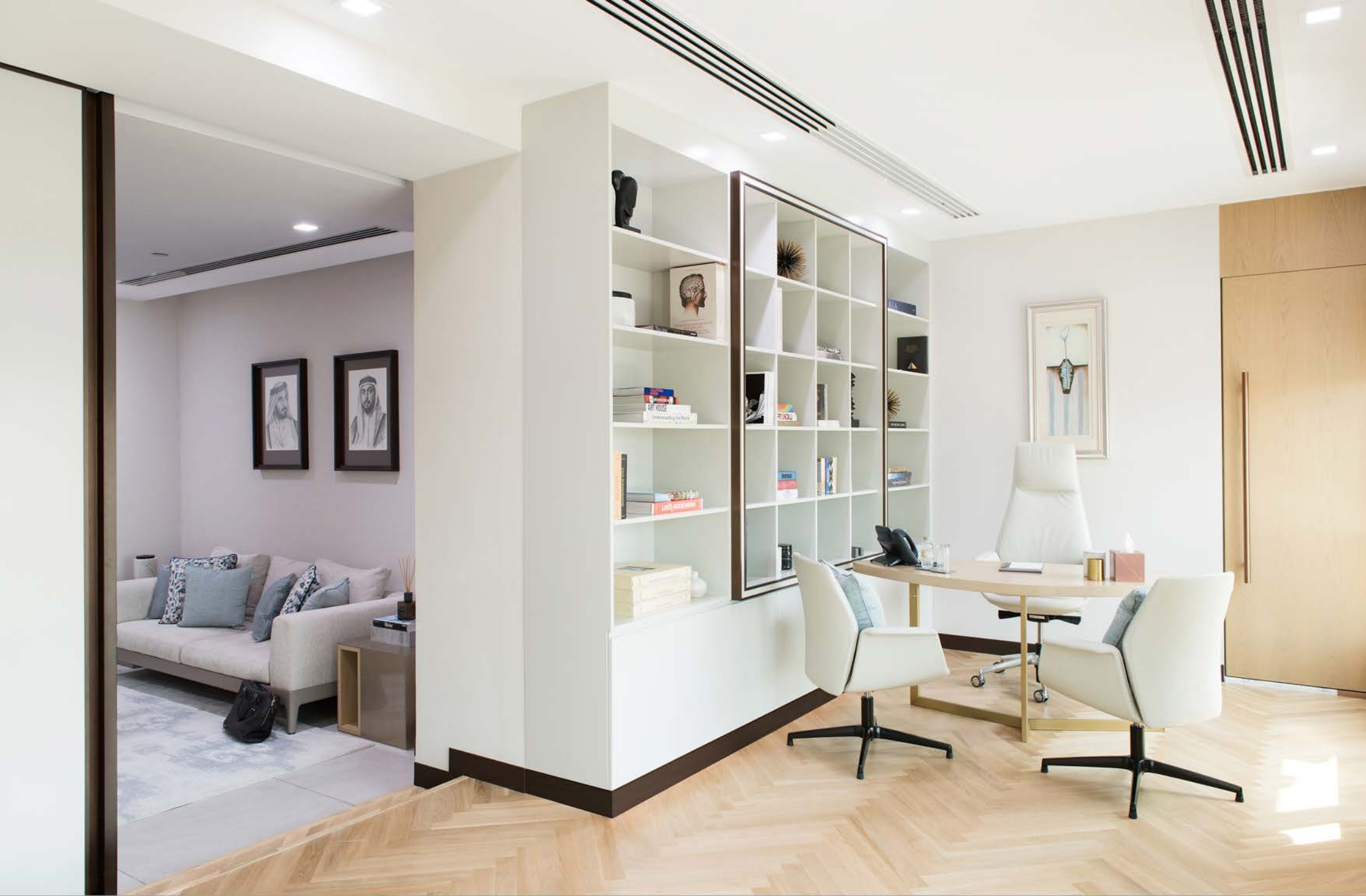
DUBAI HOLDING CHAIRMAN'S OFFICE